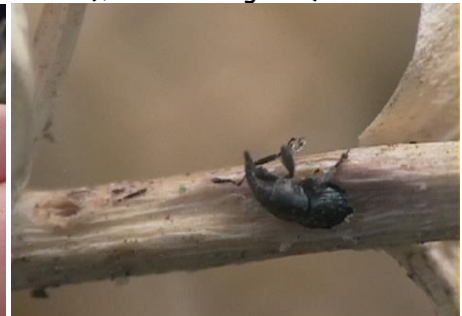
Aphthona mix release (leafy spurge), Cyphocleonus achates (knapweed), Mecinus janthinus exiting stem (toadflax)