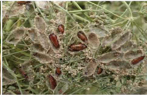
A. astroemeriana pupae (poison hemlock),