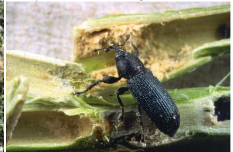
O. erythrocephala (leafy spurge), C. achates feeding (knapweed), Mecinus janthinus stem damage (toadflax)