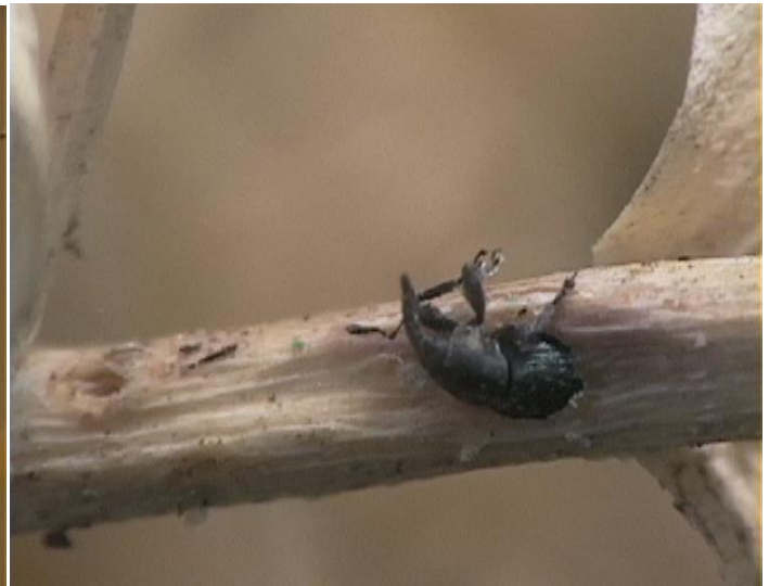
Mecinus janthinus emerging from toadflax stem.

We will answer any questions you may have, discuss your specific sites and problem weeds, and work with you to arrive at the best integrated control strategies. This includes assisting you with monitoring your existing populations of weed-feeding insects—there is no need to purchase something that you already have. Interested in establishing, collecting, and moving your own insect populations? We can advise you. Let's talk about getting there.