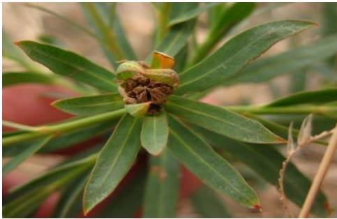
Spurgia esulae (leafy spurge),

(See back cover for more info. See inside back cover for insect price list and availability details.)