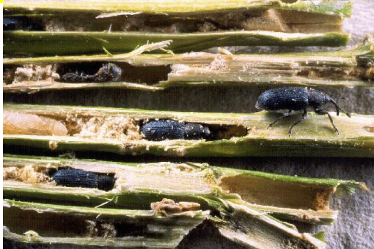
Mecinus janthinus (stem boring weevil) in toadflax stems.

Please call or email if you need more information on results and/or monitoring. We have other pictures to share.