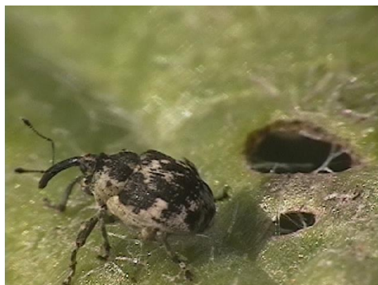
Ceutorhynchus litura (also known as Hadroplontus litura ) feeds on Canada thistle.