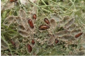
(Hemlock moth pupae) $150 per release