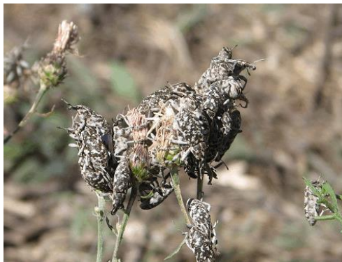
Cyphocleonus achates (root boring weevil) on knapweed.