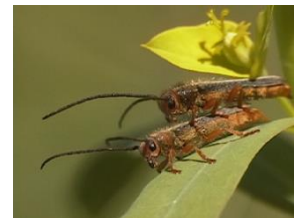
( Oberea larva in root; Oberea adults mating)

Leafy spurge tip gall midge Spurgia esulae : Larvae attack the growing shoot tips. The attacked apical tissue dies, preventing flowering, stimulating branching, and causing roots to send up new shoots. Multiple generations (up to three per summer) continue attacking new shoots. Recommended release sites have cooler areas (shading during part of the day) and dense spurge. $100 per release