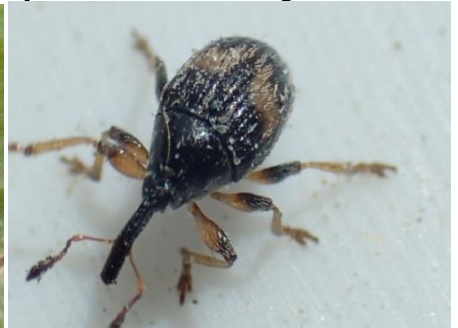
Mecinus janthinus feeding damage (toadflax), Galarucella calmariensis larva (purple loosestrife), Nanophyes marmorates (purple loosestrife flower weevil--now available in limited quantities--call early for details)