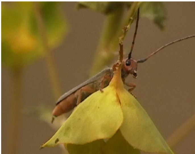
Oberea erythrocephala destroying a leafy spurge flower.

Mullein seed head weevil Gymnetron tetrum : Adult weevils lay eggs in the flower and larvae feed on the seeds and other tissues in the seed capsules, substantially reducing seed production. $150 per release