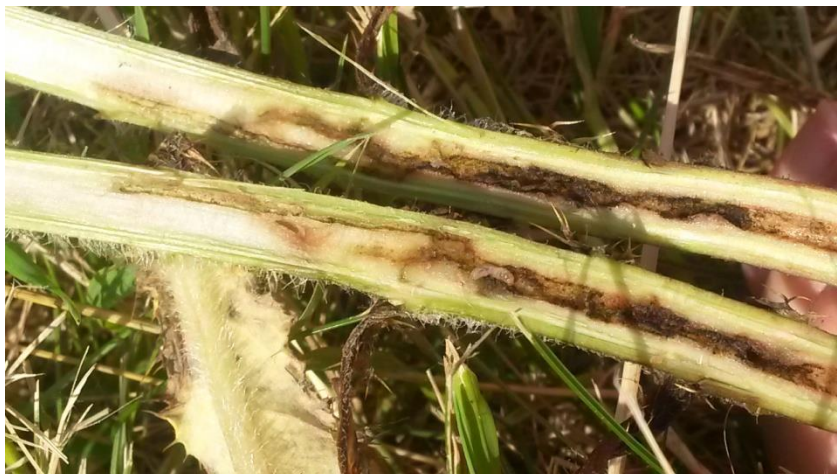
Ceutorhynchus litura larvae and larval mining damage in Canada thistle stem.