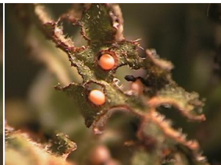
Galerucella damage on purple loosestrife: eggs and larvae, adult feeding, and eggs deposited after adult feeding.